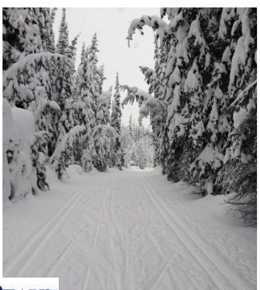
Heavy Snow Load Daily Tree cutting